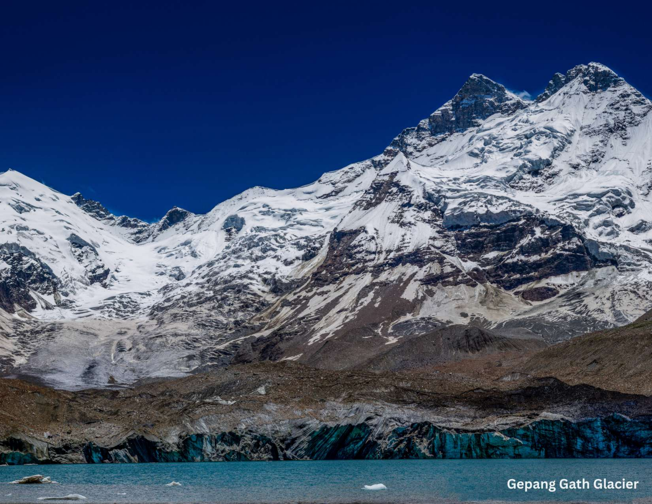
Gepang Gath Glacier